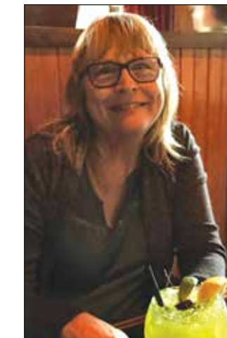
A cool cocktail hits the spot after a massage.

past trips together and silly stories from our youth. At dinnertime we pulled out the meats, cheeses,