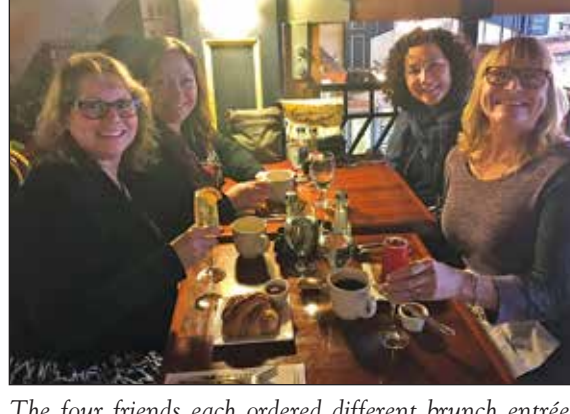
set the stage The four friends each ordered different brunch entrées, and paired including the Colette Omelet (below).

veggie platter, and wine, for an evening filled with good food, good wine, and lots of laughter.