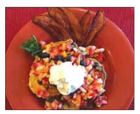
Whether you catch a fish to cook over the campfire, toss a burger on the grill, or dine out at a local eatery, you won't starve around Skamokawa. Photos, from top: Captain's Seafood Platter (The Duck Inn); Barbecued ribs (Roadkill Restaurant); breakfast entrée served to guests at The Inn at Lucky Mud.