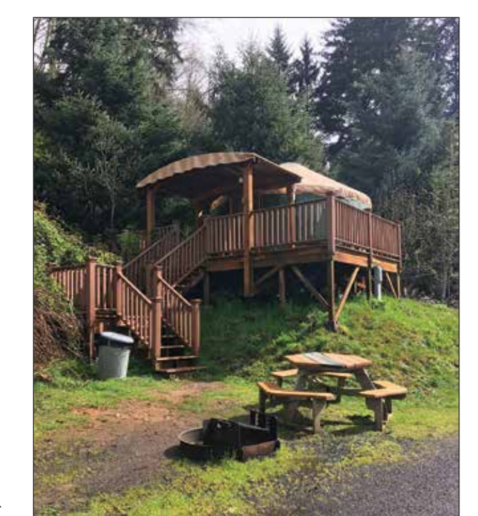
Yurts at Vista Park come equipped with a pull-out futon couch, bunk bed, and a table with four chairs.