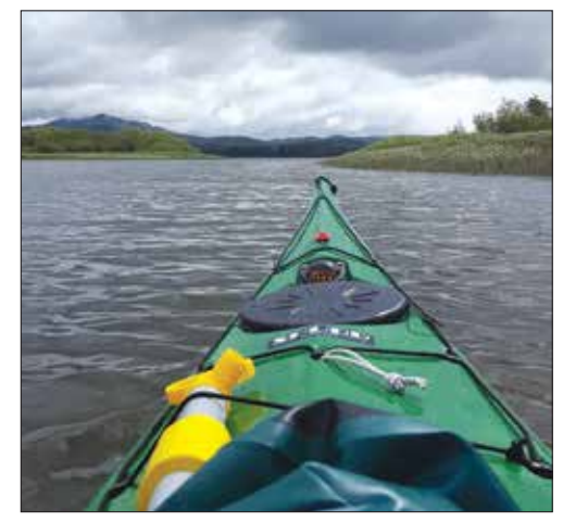
Kayaking in Skamokawa(PHOTO COURTESY OF COLUMBIA RIVER KAYAKING; below, a view on one of the Inn at Lucky Mud's two disc golf courses.

Safely inside the kayak, I settled in and began paddling up the slough.