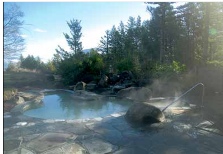
Photos, clockwise from left: St. Cloud picnic area; Skamania Lodge's lobby/viewing area; one of the outdoor hot tubs. Opposite page: Artwork on display at Skamania Lodge.