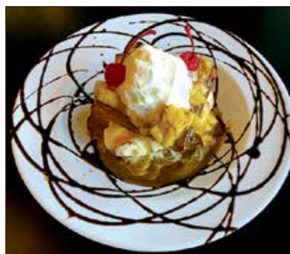
Clockwise from top: Lettuce wraps; Cadillac Margarita; Pineapple Foster.