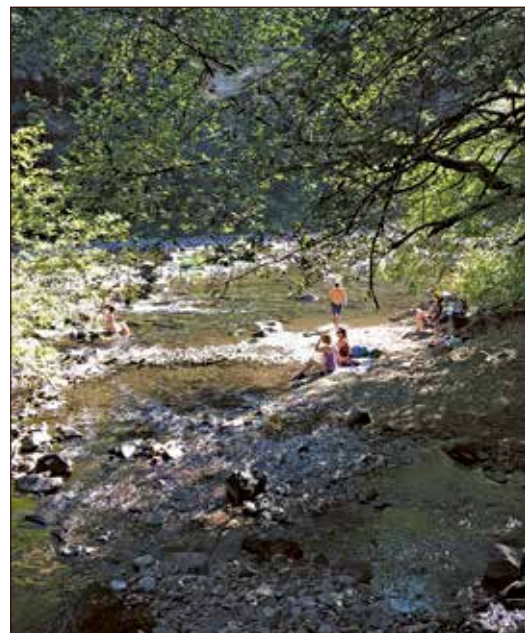
Photos, clockwise from top: Moulton Falls; the popular Battle Ground Lake; a bicyclist enjoys the trail; Lucia Falls.

Outdoor playground beckons Fall adventurers